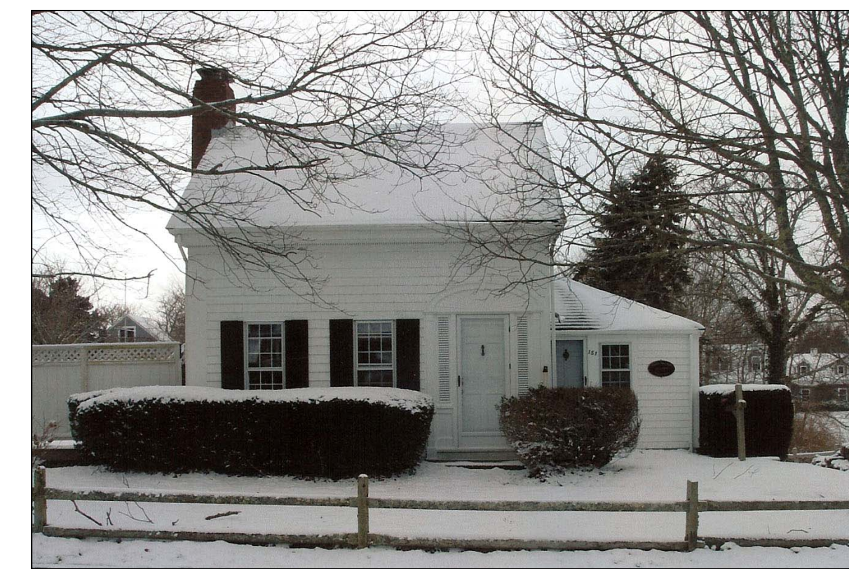
Architect & Contractor: Polhemus Savery DaSilva, Chatham, MA